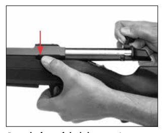
Press the front of the bolt stop to insert or remove the bolt.

not yet burnished from use, it may be difficult to rotate the bolt sleeve by hand. If so, carefully grasp the firing pin sear in a padded vise and lift the bolt handle. The AB3 rifle comes packed in a foam-padded box with the bolt removed from the rifle. To install the bolt into the receiver perform the following procedure: