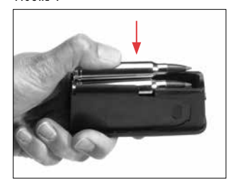
Press the cartridge straight down until it snaps into place under the feed lips.