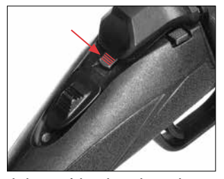
The location of the cocking indicator, shown in the cocked position.