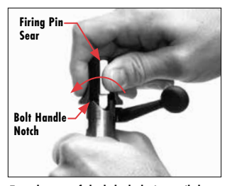
Turn the rear of the bolt clockwise until the firing pin sear engages the notch in the bolt handle.