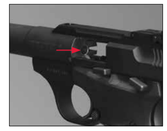
With the slide locked to the rear, inspect the chamber to be sure it is empty.

ALWAYS READ THE AMMUNITION LABEL AND ANY ENCLOSURES WITH THE AMMUNITION TO ASSURE THAT THE AMMUNITION IS APPROPRIATE OR THAT THERE IS NO RESTRICTION FOR ITS USE WITH YOUR FIREARM.