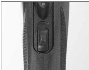
The "safety" shown in the on safe position.