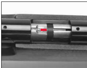
The cocking indicator showing the firing pin is in the cocked position.