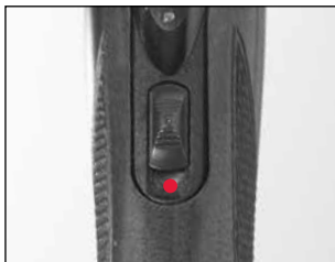
The "safety" shown in the off safe position.