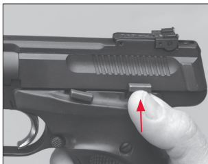
Engaging the manual thumb “safety.”