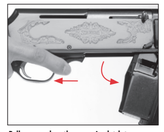
Pull rearward on the magazine latch to access the magazine.