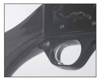
FIGURE 2 FIGURE 3