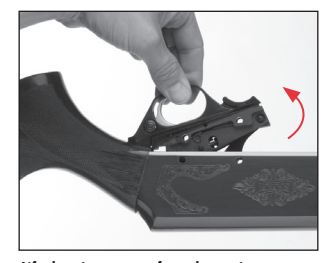
Lift the trigger group from the receiver.