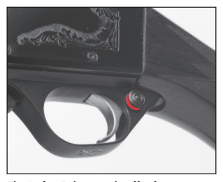
The "safety" shown in the off safe position.