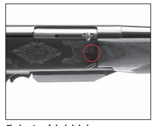
The location of the bolt lock.