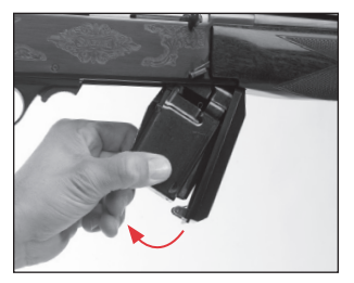
Grasp the sides of the magazine and detach it from the floorplate.