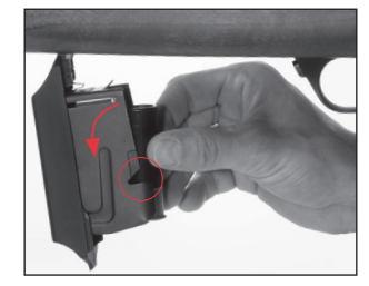
Place the rim of a shell in the rim slots and slide the shell to the rear of the magazine.

4 Once the magazine has been detached, it may be loaded by laying a shell on top of the follower, aligning the shell's rim with the rim slots and pressing the shell down and rearward until it is retained in the magazine. Load a subsequent shell into the magazine in the same manner.