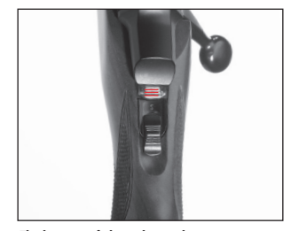
The location of the cocking indicator.