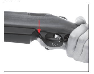
Press the magazine release.