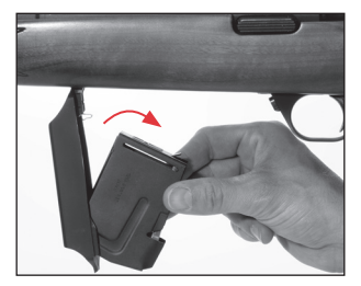
Grasp the sides of the magazine and pull it from the floorplate.