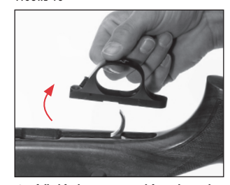
Carefully lift the trigger guard from the stock.